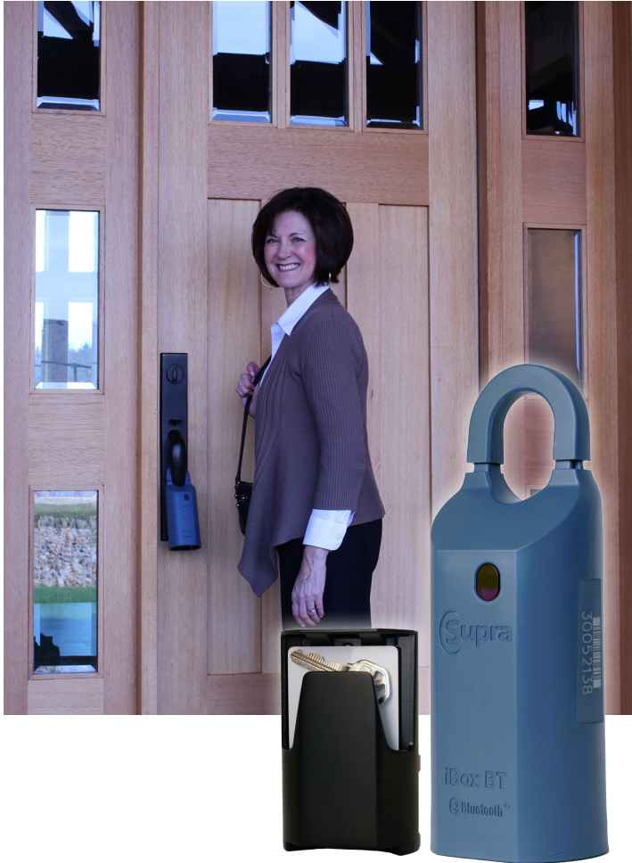
Supra keyboxes provide peace-of-mind and an electronic record of showings

Provide convenient, authorized access for agents. Know who showed your home and when.